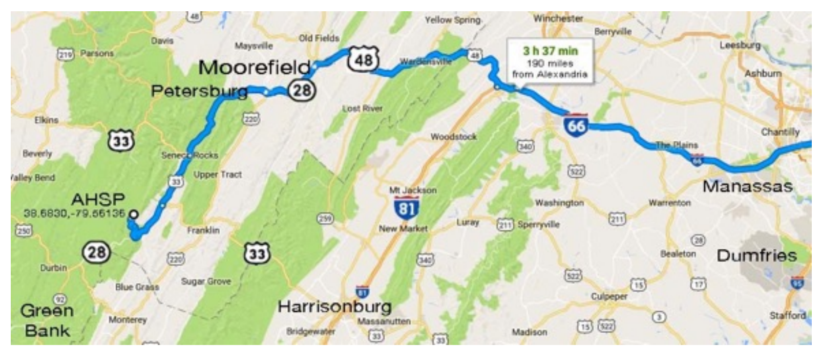
Recommended route is through Moorefield. Rt33 from Harrisonburg has steeper grades and tight cutbacks.

Recommended routing through Moorefield, WV